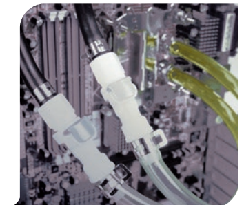
Figure 2: Quick disconnects for server cooling

Some liquid cooling systems employ couplings developed for the hydraulics industry because of their perceived higher durability. However, the seals and internal valves of these couplings were not designed for low-pressure applications and where couplings are required to be connected for months or years at a time. When selecting quick disconnect couplings for liquid cooling systems, look for couplings that are designed specifically for low-pressure applications and feature robust construction.