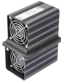
Laird Air-to-Air Tunnel Series