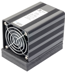
Laird Direct-to-Air Tunnel Series

Thermoelectric assemblies (TEAs) are cooling and heating systems that use thermoelectric modules (TEMs) to transfer heat by air, liquid or conduction methods that include integrated temperature controls. TEAs remove the passive heat load generated by the ambient environment in order to stabilize the temperature of sensitive components used in medical lasers.