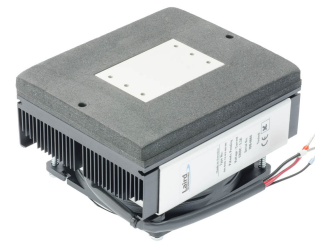
Laird Direct-to-Air PowerCool Series

TEAs are designed and manufactured to strict process control standards and pass/fail criteria, assuring that our customers receive the best possible TEAs. Our standard product portfolio includes an extensive array of thermal management solutions that cover a wide range of cooling capacities with compact form factors and high coefficient of performance. The standard product offering includes heat transfer mechanisms designed to absorb and dissipate heat by convection, conduction or through liquid heat exchangers. All products are manufactured in an ISO 9001:2008 certified facility.