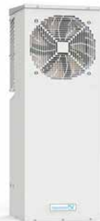
Air-to-air heat exchangers can offer an efficient solution in harsh conditions.

While still offering the cost efficiencies that come with using ambient air, an air-to-air exchanger offers a variety of cooling capacities while ensuring total separation of enclosure and ambient air. Applications include indoor-temperature-controlled environments, common in IT sector and food and beverage applications.